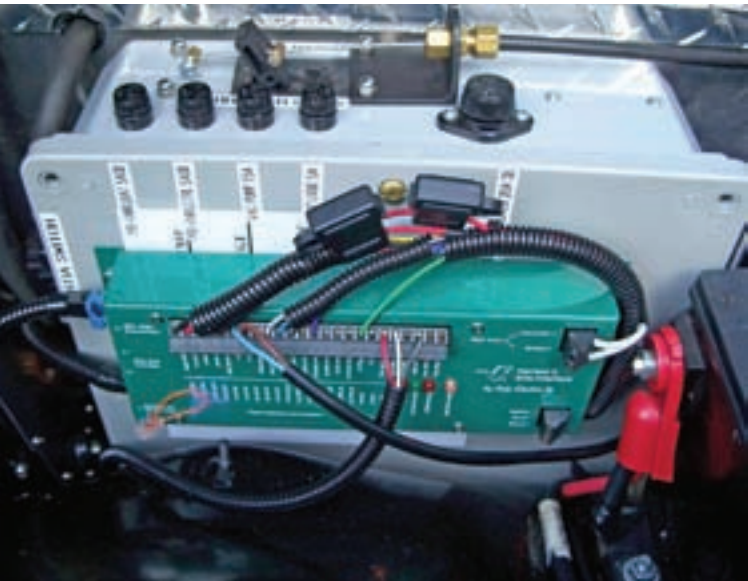
The control box, with the logic interface mounted on its cover.