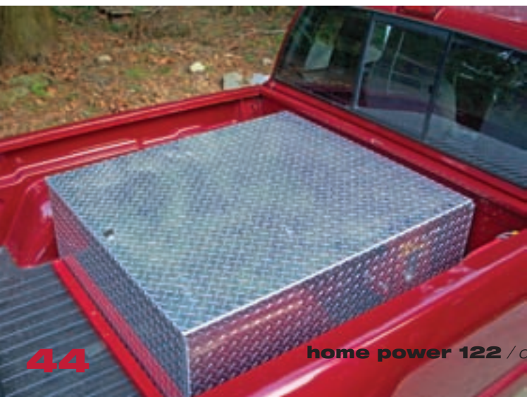
In the bed—a custom battery box holds eighteen T-145s.

A mechanically sound vehicle is key to a successful conversion. "The vehicle had to be something that I would be happy to drive," he says. "I did not want to invest my time and money into an unsound or unsightly vehicle. I wanted a vehicle that was in good shape and had some longevity." A late-model 2001 GMC Sonoma pickup with an extended cab, five-speed transmission, and fewer than 80,000 miles on its odometer filled the bill.