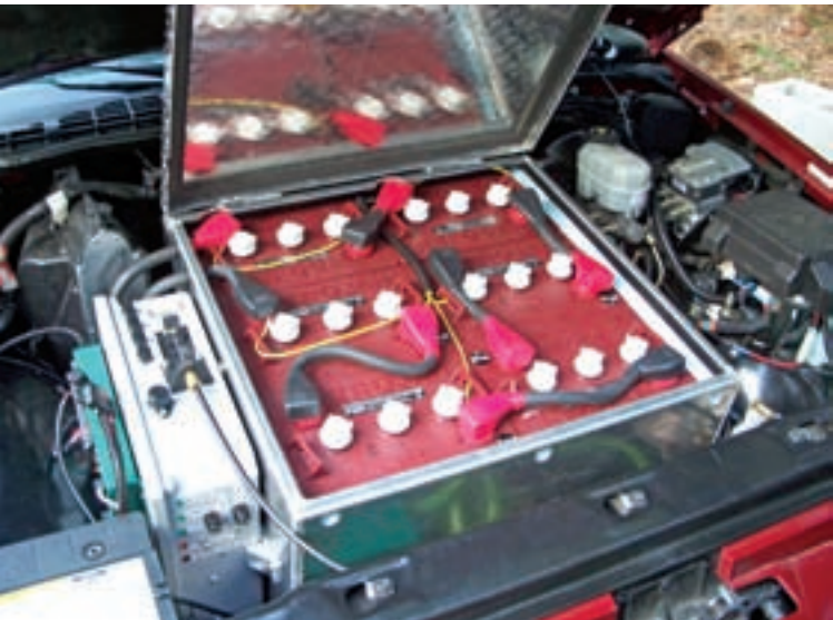
Above the drive motor— six T-145 lead-acid batteries and the control box, mounted to the left of the batteries.

Richmond carefully evaluated his weekly commute: four 18-mile trips along local, rural roads near his home in Woodinville, Washington, and one 40-mile trip to nearby Issaquah with some distance on Interstate 405. The highway driving, though brief, necessitates that the vehicle reach 60 mph. He needed enough horsepower to handle the extra weight of the batteries in the vehicle and get up the hills along his commute. He decided against power-intensive air conditioning and power steering but elected for power brakes and electric heating, given the weight of the vehicle and the cool, rainy conditions in the area. Though the vehicle would be used primarily for commuting, he wanted enough seating for his family.